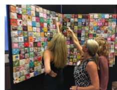
NEVADA NAMI Conference