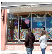
WISCONSIN Shop Window