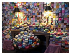
COLORADO Church Lobby