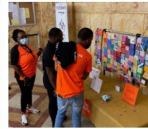
NEW JERSEY City Hall