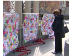
MARYLAND State House Entrance